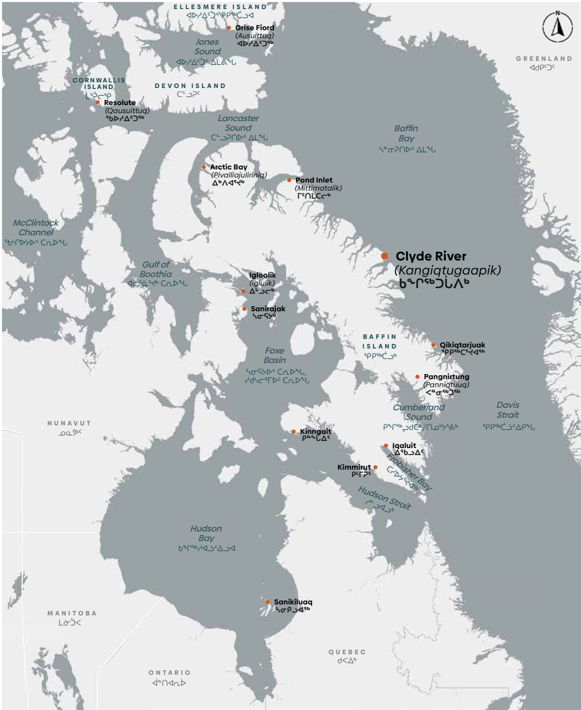
© Qikiqtani Inuit Association, 2024 | ᐅᓗᓗᓗᓗᓗᓗᓗᓗᓗᓗᓗ ᓄᓄᓗᓗᓗᓗᓗᓗ ᐃᓄᓗᓗᓗᓗᓗ ᐃᓄᓗᓗᓗᓗᓗ 2024