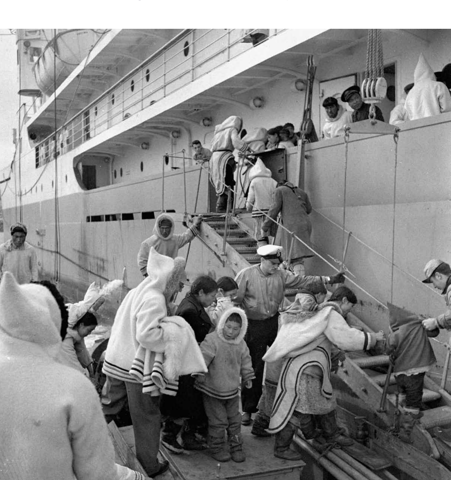
24 | Qikiqtani Truth Commission: Community Histories 1950–1975