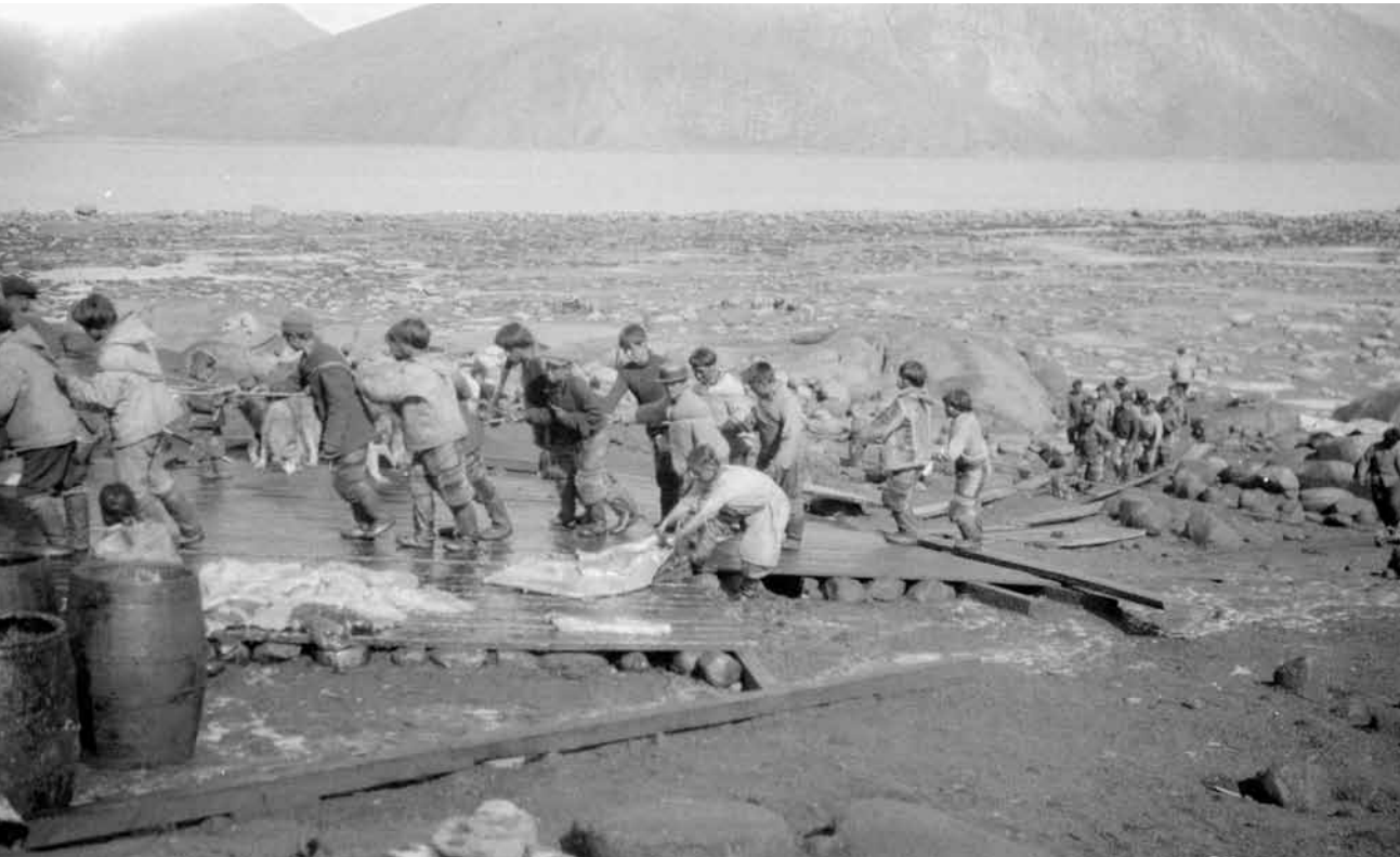
Hauling white whale hides, Pangnirtung, August 1929

population scattered into ilagiit nunagivaktangit, mostly around sites that their ancestors occupied before 1840. From there they hunted all types of seal and caribou as before, took beluga whale and walrus seasonally, and trapped white foxes. They traded these, along with sealskins and seal oil, for imported food and manufactured goods at Pangnirtung at least once a year, or more often if they lived close to the trading post. This economy remained the basis of most people's annual routine until 1962, when a growing number of government officials and services at Pangnirtung drove a third wave of change. This change disrupted the hunting and trapping economy and put great pressure on individuals to relocate permanently to the settlement. This re-settlement was virtually complete by 1970.