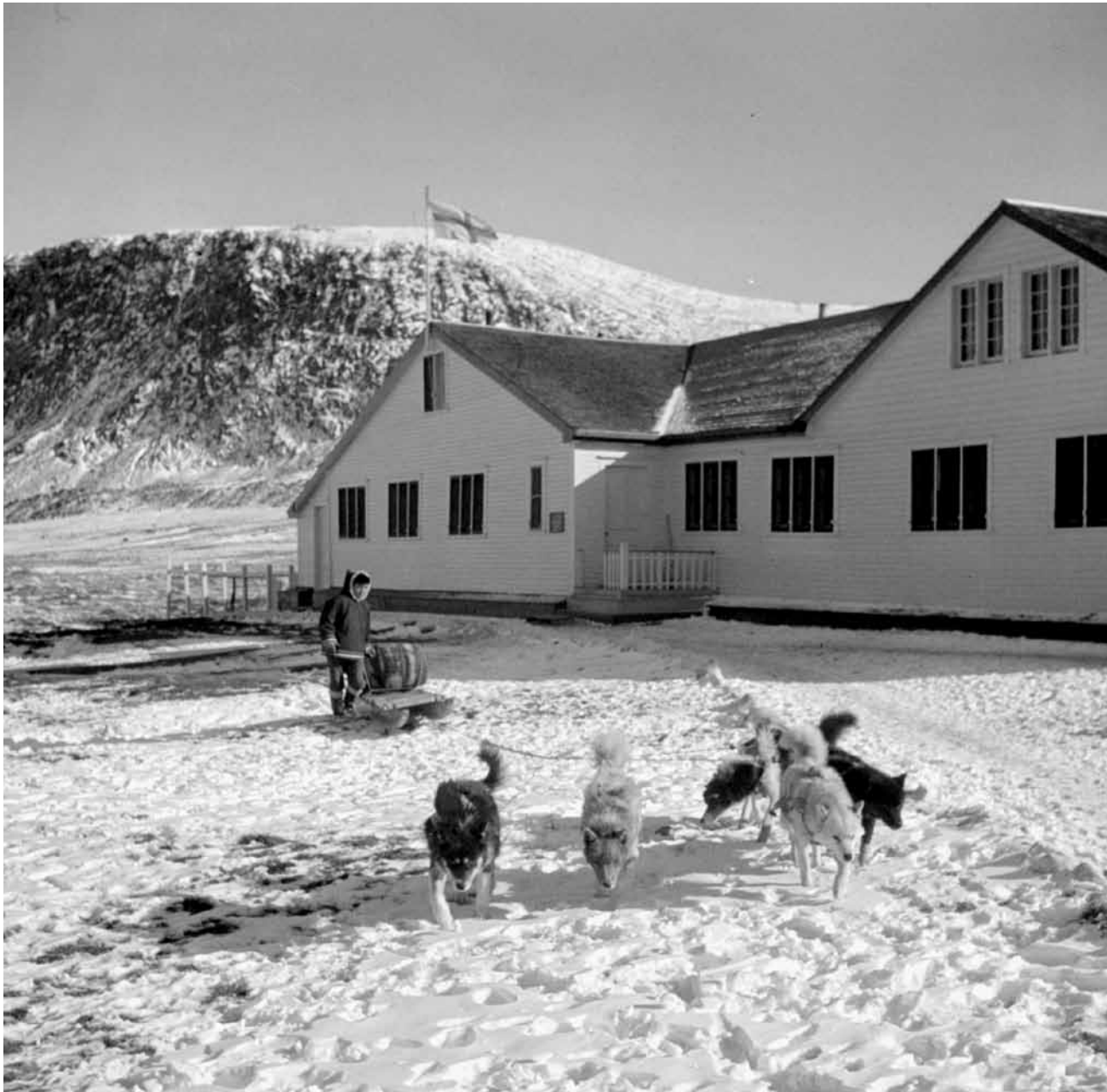
Dog team delivering drinking water to St. Luke's Mission Hospital, August 1946