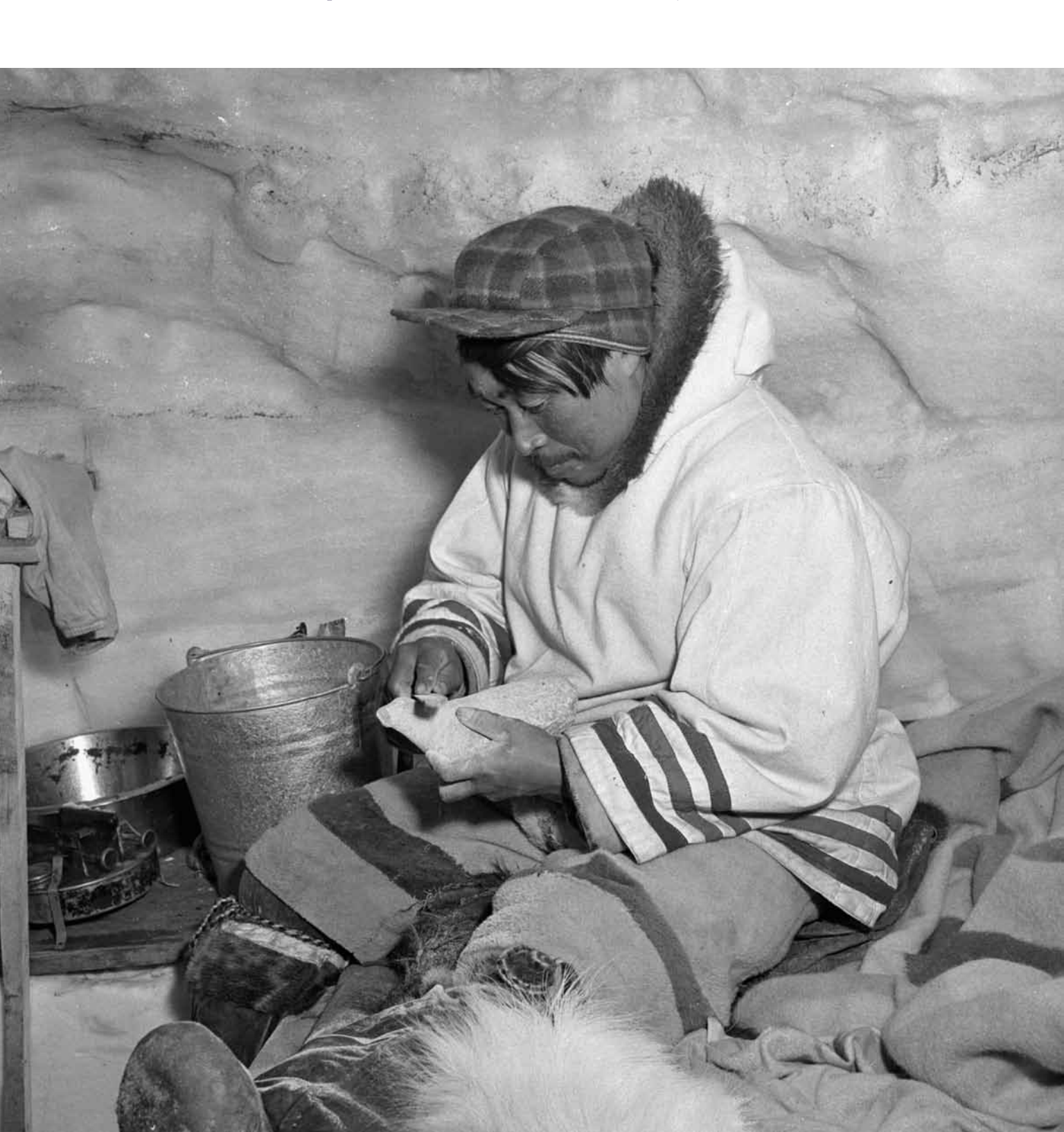
34 | Qikiqtani Truth Commission: Community Histories 1950–1975