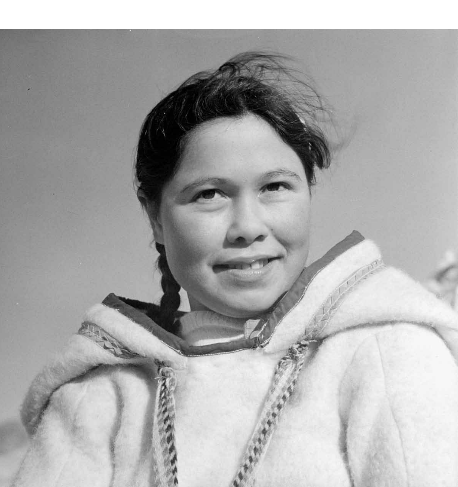
54 | Qikiqtani Truth Commission: Community Histories 1950–1975